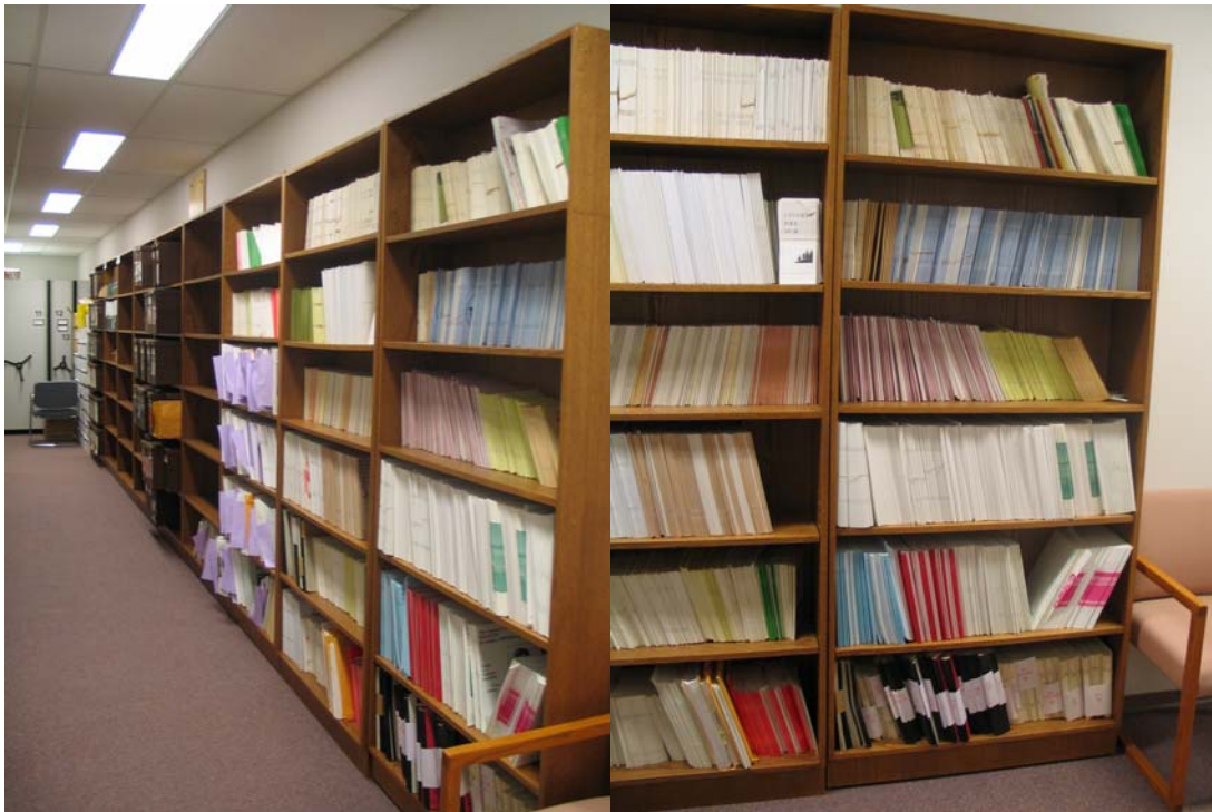
Figure 1 The back issues' new home in the Arts Building at the University of Alberta